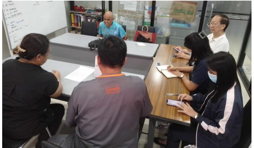
Vibrant Club Seminar... Sept. 7, 2024, Acacia Hotel